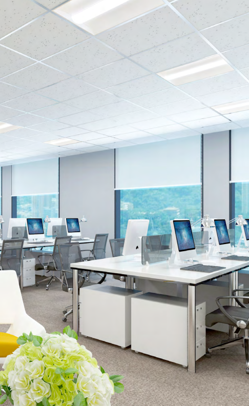
Diffuse round lens