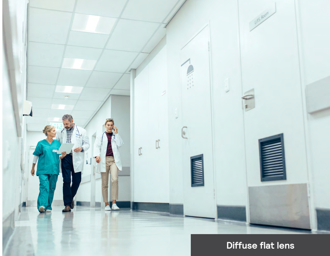
Diffuse flat lens