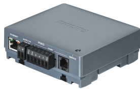
PDEG Ethernet Gateway