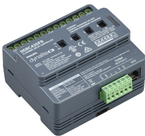
DDRC420FR Relay Controller