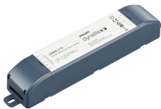
DYNET-STP-CSBLE-LSZH Data Cable