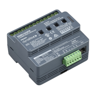
DDRC420FR Relay Controller