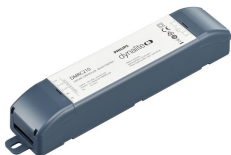
DYNET-STP-CSBLE-LSZH Data Cable