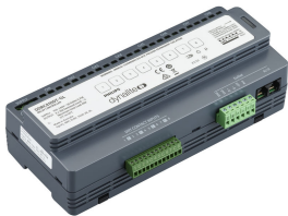
DDRC810DT-GL 8 x 10A Relay Controller