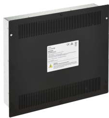
DH2x24, DIN Rail Enclosure