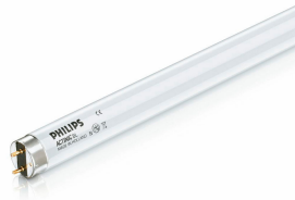
Actinic BL TL-D 15W/10 1SL/25