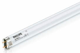
Actinic BL TL-D 15W/10 1SL/25