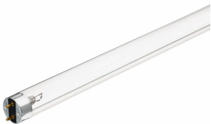
Philips TUV T8 10W SL/25