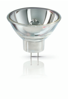
XPPR XHOPDI 0005