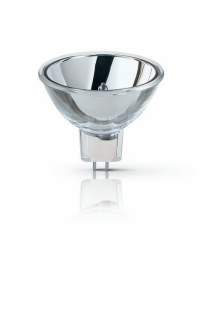
XPPR XHOPDI 0002