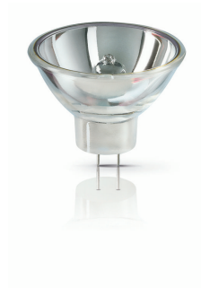
XPPR XHOPDI 0005