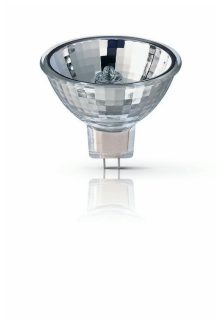
XPPR XHOPDI 0001