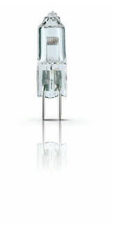
XPPR XHMPSEFF 0003