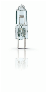
XPPR XHMPSEFF 0003