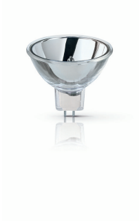
XPPR XHOPDI 0002