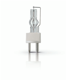
XPPR XDMSR 0017