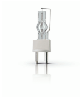
XPPR XDMSR 0017