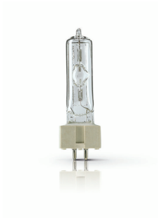
XPPR XDMSR 0025