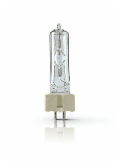
XPPR XDMSR 0025