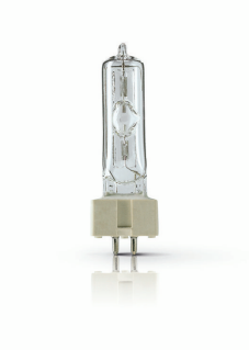
XPPR XDMSR 0025