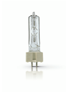
XPPR XDMSR 0025