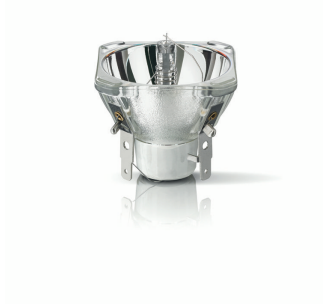
XPPR XDMSD 0010