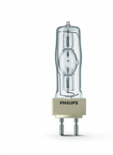
XPPR XDMSD 0013