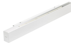
TrueLine Wallmounted- WL532W- detail