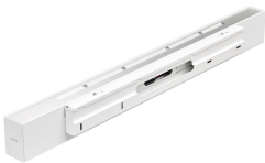
TrueLine Wallmounted- WL532W- detail