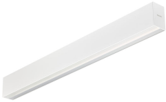
TrueLine Wallmounted- WL532W