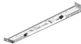
SmartBalance Wallmounted- WL484W- detail