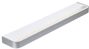
SmartBalance Wallmounted- WL484W- detail