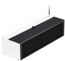
UV-C disinfection upper air Wall mounted version high output