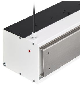
Wall mounting plate and indicator light