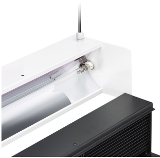
Access to lamp and product maintenance