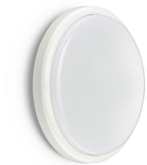
Ledinaire Wall-mounted WL070V