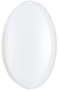
Ledinaire Wall-mounted-WL060V LED11S