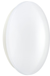
Ledinaire Wall-mounted-WL060V LED17S