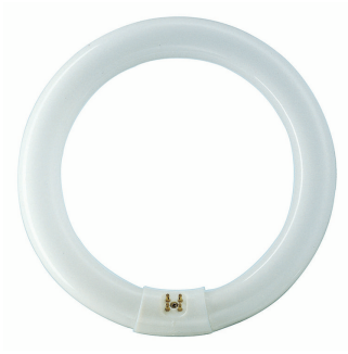
30 W G10q Cool daylight Circular fluorescent - RFT