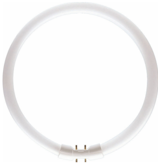
22 W Cool white Circular fluorescent - RFT