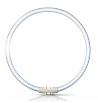
55 W 2GX13 Warm white Circular fluorescent - RFT