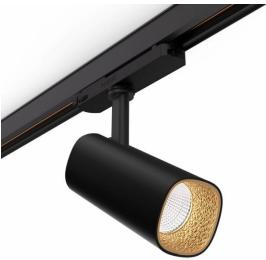
Smooth Track – TCST65-12S-830-PSU- HNB-BK482-BS-T304