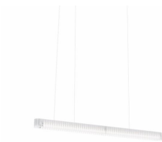
Puzzle Linear- TCPZLN_4FT_CL000T_40 S_940_SIA_U5_WB- OC_SM2_WH481