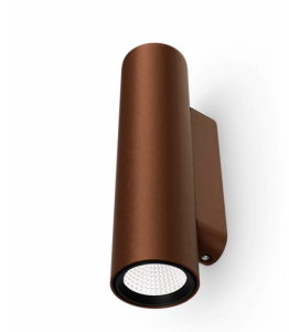
Accent Wall D65- TC65L2-8S-PW930-PSU- HMB-FG-T102-BZ410