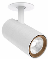
Accent Semi Recessed D65-TCATSR-20S-PC930- PSU-E-CLM24-T204- WH481-BS-68