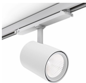
Accent Track D90- TCAT90-27S-PW930-PSU- MB-T102-WH481