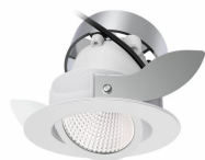
Accent Recessed D65- TCARAD-17S-PC930-PSU- E-HWB-WH-90