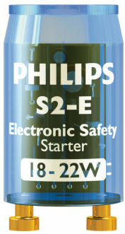
LPPR STARTER S2E BL PHL