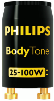
BodyTone 25-100 W, BK