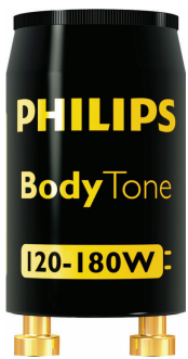
BodyTone 120-180 W, BK