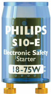
S10E, 18-75W, BL