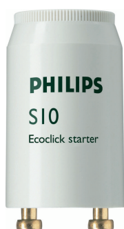
LPPR STARTER 0001