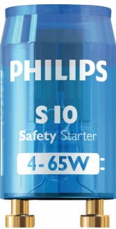
LPPR STARTER PHL 0003