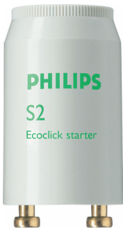
LPPR STARTER PHL 0004