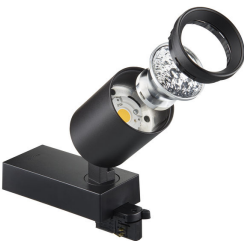
StyliD Evo Exploded View