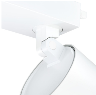
Aiming indication, with marking for Indoor Positioning operation