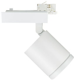
StyliD Evo Performance white, side view