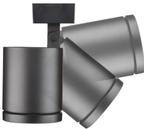
StyliD Evo Performance in white, full rotation flexibility