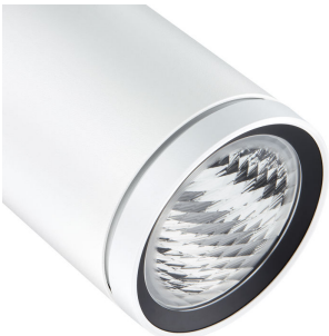
OptiShield protects the optical compartment from bugs and dust