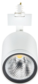
StyliD Evo Performance white, front view