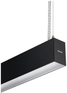
TrueLine Suspended black housing