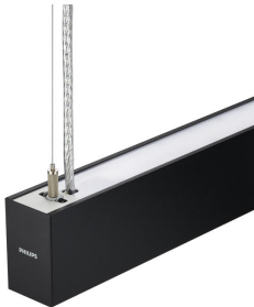
TrueLine Suspended black housing