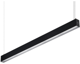
TrueLine Suspended black housing