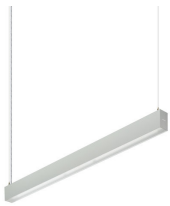
TrueLine suspended-SP530P SP532P L1130 ALU