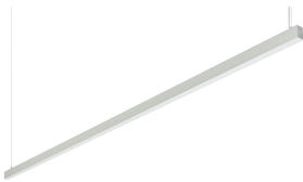
TrueLine-SP530 L2810 Alu