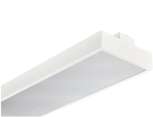
Maxos fusion Office DPP optics