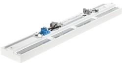
Maxos fusion Office DPP 1