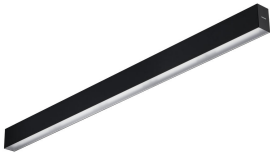
TrueLine Surface Mounted black housing