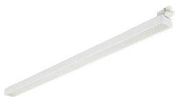
StoreSet Linear full length, white