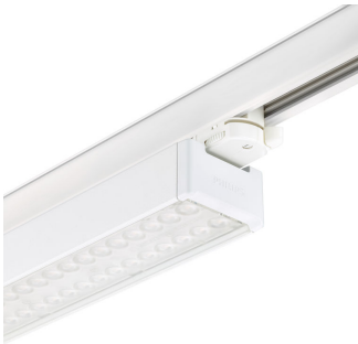
StoreSet Linear close-up track adaptor + endcap, white