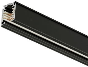
RCS750 track, black