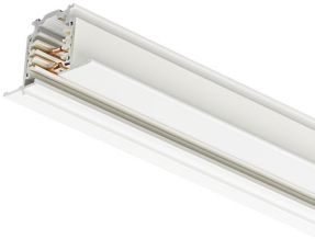
RBS750 recessed track, white